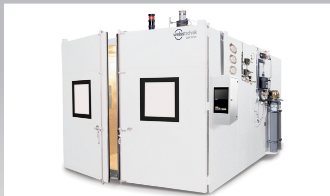
EUCAR Hazard Levels 1,2,3,4,5,6

If the standard test chambers are not large enough for you or the test requirements call for a special solution, Weiss Technik offers you almost unlimited options. As a single-source supplier, we develop and implement test chambers and test rooms for modules, packs and complete drive units, with or without BMS. In terms of size, you have choices ranging from walk-in test chambers up to test rooms for entire vehicles.