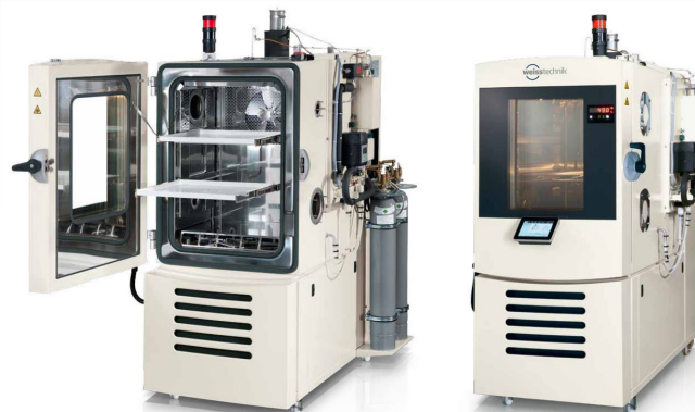
EUCAR Hazard Levels 1,2,3,4,5,6,7

Special testing tasks require special test chambers. This is why we modify the standard chambers according to the hazard assessment and requirement at hand. For example, by adding safety components such as a flushing device with a particularly high air replacement rate. In addition, we offer a wide range of special solutions, such as positioning the control technology above the test chamber, for heavy-duty gratings with a telescopic system and drawer systems for up to 12 batteries with a guide-through and plug-in connector panel.