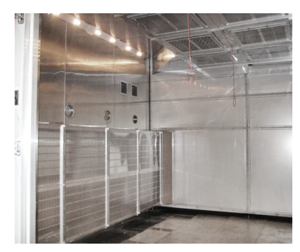
Custom Electronics Testing