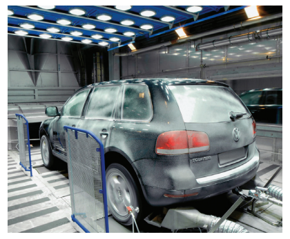
Full Vehicle Testing Combined Temperature/Humidity/Lights/Dyno