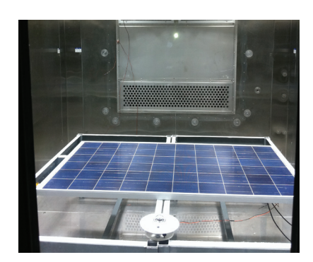
Photovoltaic Cell Testing